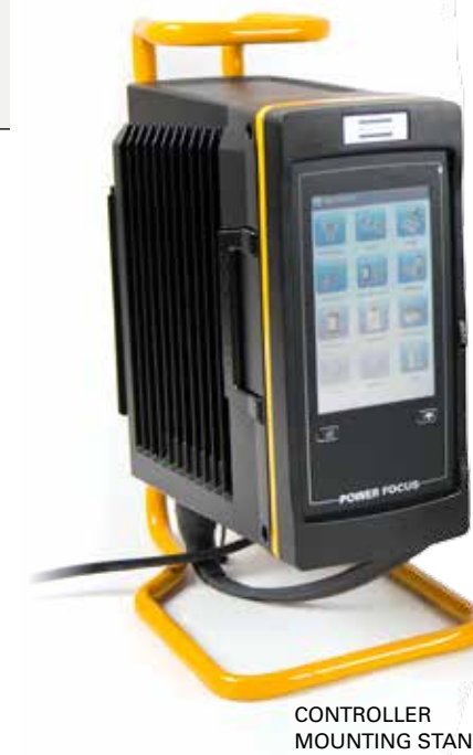
CONTROLLER MOUNTING STAND